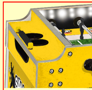
Score Counter Panels